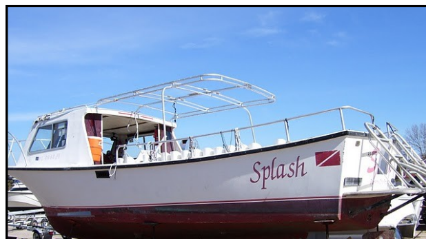
Deep Water Horizon before being moved from Florida to South Dakota and re-named.

We have chartered the Deep Water Horizon (34 ft X 12 ft fiberglass boat) for an August trip. We will spend Saturday and Sunday spearfishing in the lake. If you're new to spearfishing, we can offer an Underwater Hunter Specialty